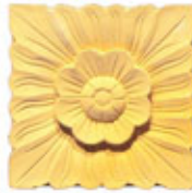
L14 x W14 x 3.5cm(thk)