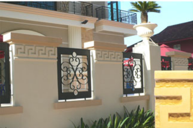
L30206 L30 x W20 x 3cm(thk)