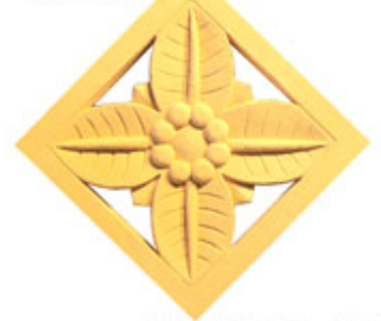
L20 x W20 x 2.5cm(thk)