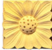
L15 x W15 x 4cm(thk)