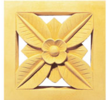
L30 x W30 x 3.5cm(thk)